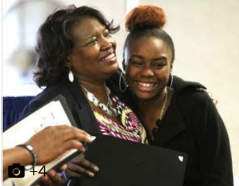
Truancy program hails grads