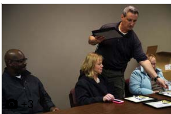
Merrillville residents graduate from citizens police academy

Authorities have said attendance is monitored and any child found outside of a school campus during school hours will be detained and returned to school. After 10 unexcused absences, the matter is referred to the Gary Truancy Court program.