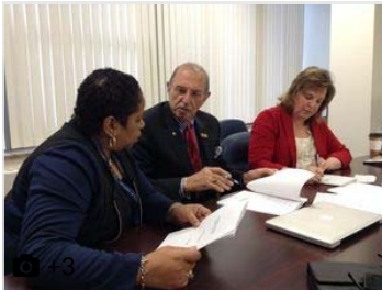
E.C. school officials face challenges at Block

Lewis-Shannon said all three schools within Lighthouse Academies charter schools, including the location in East Chicago and the two Gary campuses, had good attendance. An attendance award will be presented monthly to schools which show improved attendance.